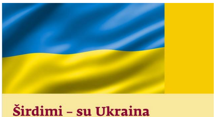
Our hearts are with Ukraine

ERGO Lithuania celebrated its 10<sup>th</sup> year of collaboration with the Vilnius International Film Festival "Kino pavasaris" (Cinema Spring) in 2022. The festival features award-winning quality films that highlight current social issues. This year, the films were also equipped with Ukrainian subtitles, and ERGO employees had the opportunity to participate in the program introduction and discuss the films with industry professionals at the festival.