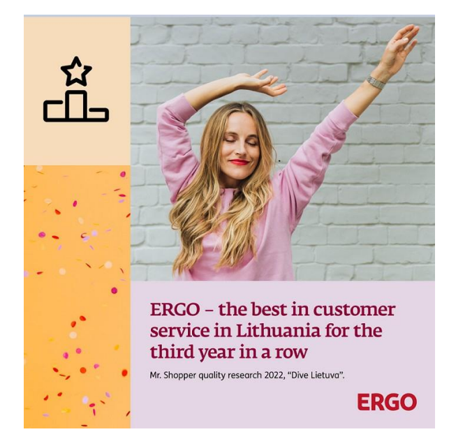
Net Promoters Score 2022, ERGO Baltic

In 2022 market research firm Dive conducted a sector-specific study on insurance companies, and based on mystery shopping exercises, ERGO Insurance in Estonia and Lithuania was found to have the best customer service in the insurance industry. We are especially proud, that in Lithuania the first position among insurance companies was held already three years in a row.