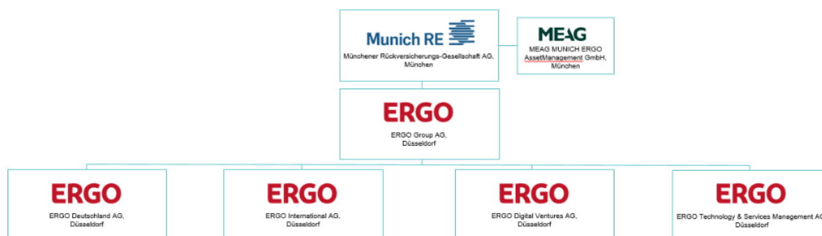
Figure 1. Structure of Munich Re and ERGO Group AG

The Company is 100% owned by ERGO International AG, Germany, which is part of the ERGO Group AG, Germany, which in turn is part of the Munich Re Group (Münchener Rückversicherungs-Gesellschaft AG, Munich), see Figure 1 below. ERGO Group is one of the major insurance groups in Germany and Europe, offering a comprehensive spectrum of insurance services.