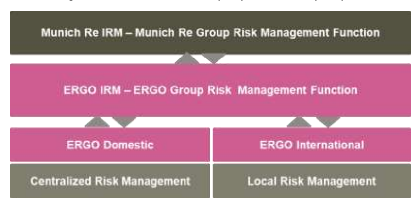
Figure 2: Risk Management Organization within Munich Re and ERGO Group

Methods, standards, processes and policies are defined by ERGO IRM in line with the overall Munich Re Group framework. Local risk management function is responsible for implementing the IRM methodology on a legal entity level. The Management Board of the Company is ultimately responsible for risk management.