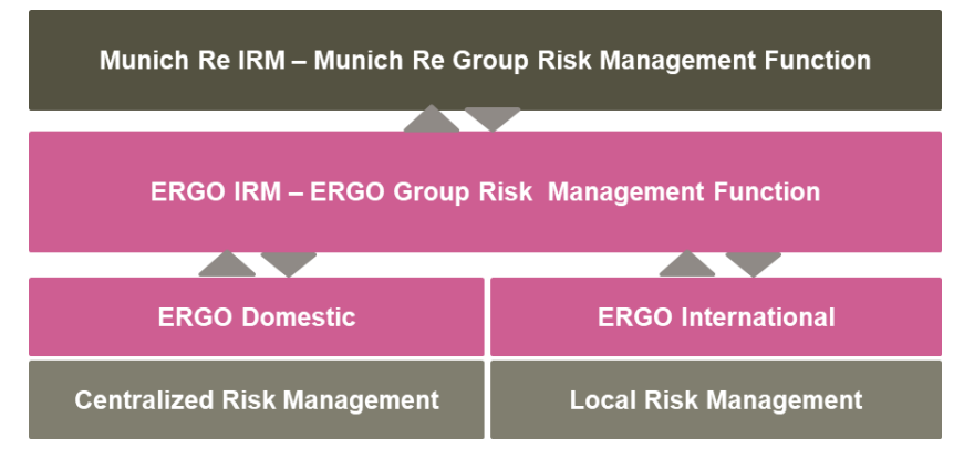
Figure 2: Risk Management Organization within Munich Re and ERGO Group

Methods, standards, processes and policies are defined by ERGO IRM in line with the overall Munich Re Group framework. Local risk management function is responsible for implementing the IRM methodology on a legal entity level. The Management Board of the Company is ultimately responsible for risk management.